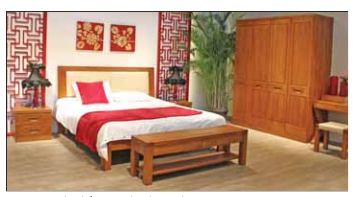
American Red Oak furniture by China Beking.

to be cultivated and educated. The abundant information from AHEC and NHLA such as species guide, lumber grading standards, market research, training courses and so on, help in educating the Chinese market. A furniture manufacturer or other solid wood producer who intends to purchase American hardwoods can benefit from the readily available information."